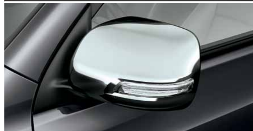
Mirror covers Carefully shaped for a secure fit around the indicator light and with a deep chrome finish to emphasise your car's sculptural mirror design.