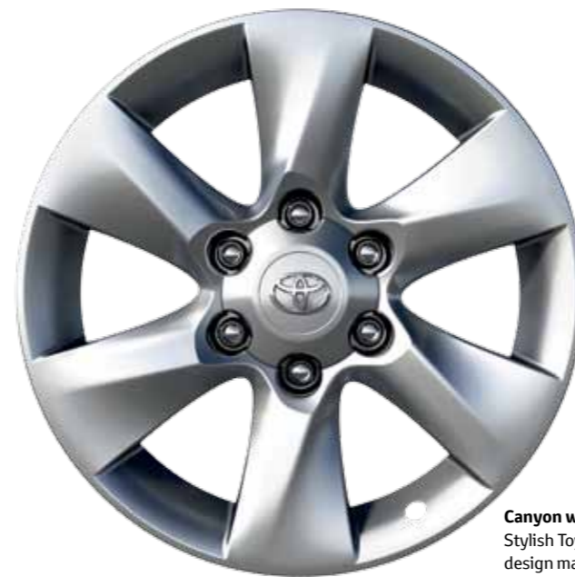
Canyon winter wheel, 17" Stylish Toyota alloys in a design made for winter tyres. When the weather turns you can switch to winter wheels for safe driving while still maintaining your car's prestige appearance.