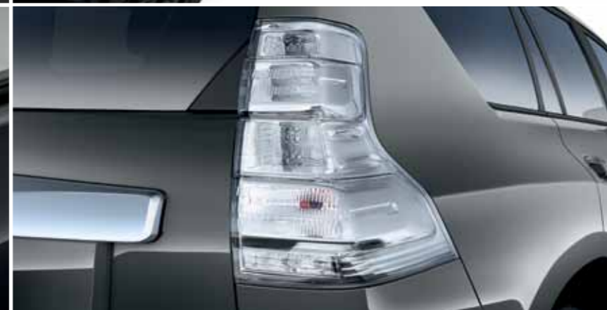
Rear combination lights Designed as an alternative to your car's existing rear light cluster. The look is refined, stylish and ultra-modern.