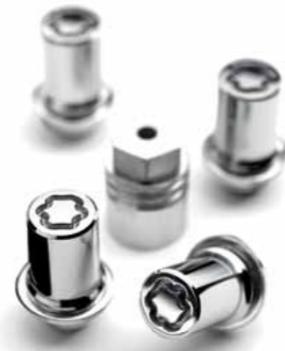
Wheel locks The rounded profile and unique coded key maximise alloy wheel anti-theft security. Made of hardened steel and with a chrome finish to visually complement your existing wheel nuts.