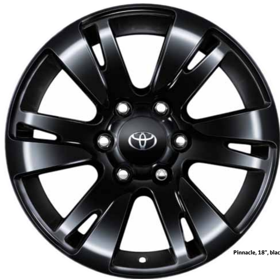
Pinnacle, 18", black

Style is personal. It's about adding extra touches of individuality. Toyota accessories give you that freedom. With choices ranging from alloy wheels to a rear skirt and chrome garnishes you can create a look for the way you like to be.