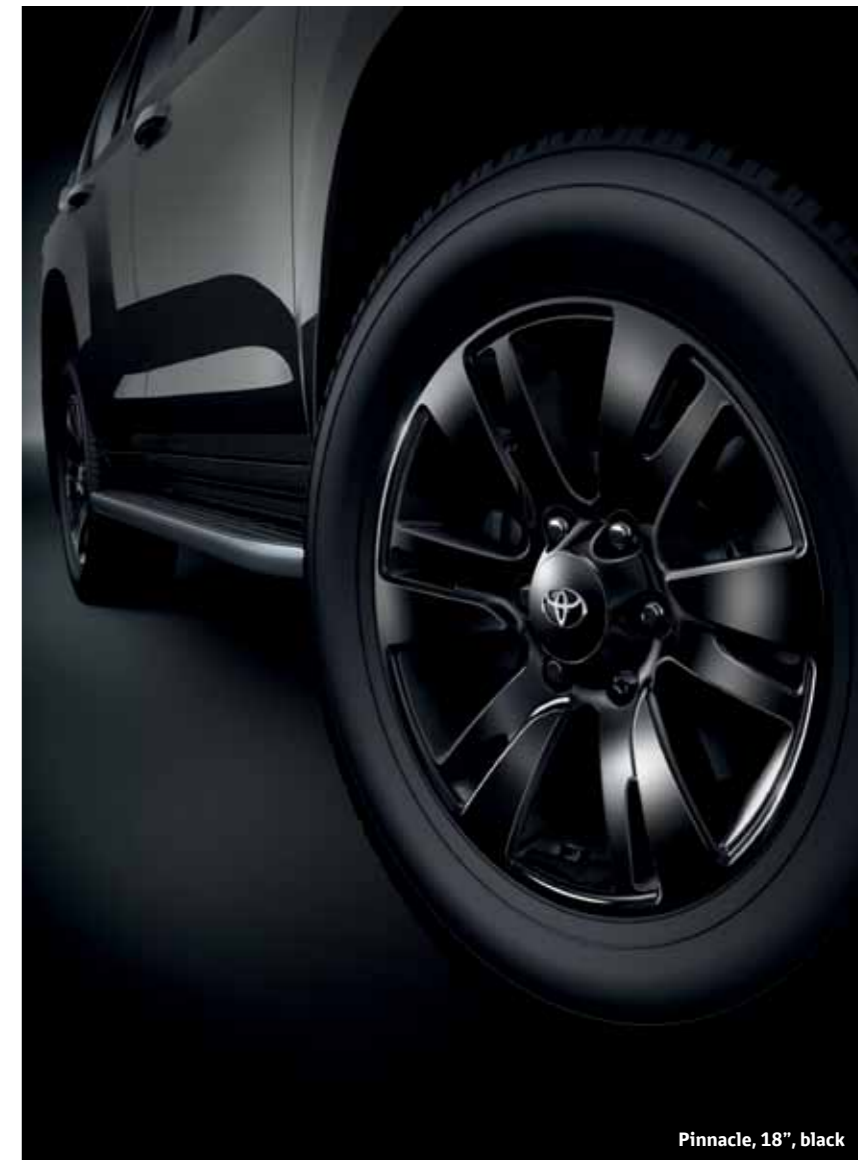
Pinnacle, 18", black